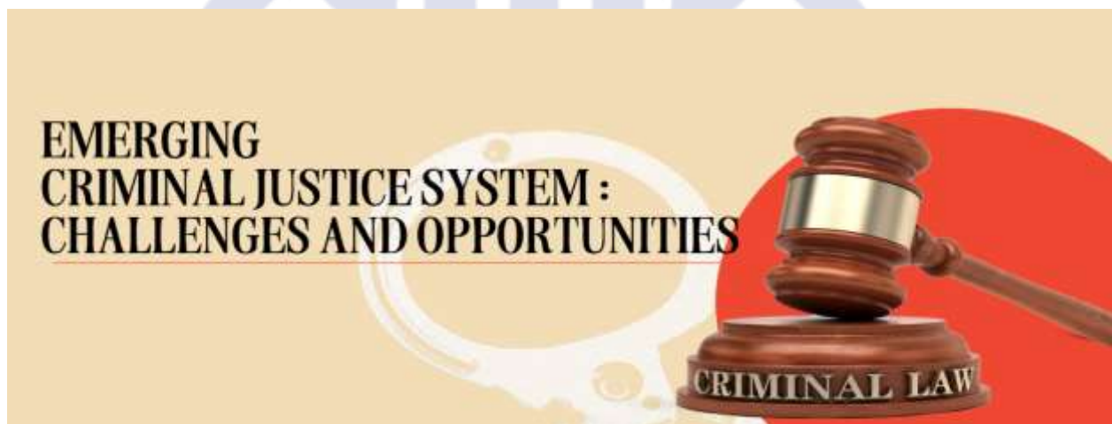
Figure-1- A Image and Symbol of New Criminal Law.

The introduction of India's new criminal laws has stirred considerable debate across legal and judicial [2] circles. These reforms are designed to address the growing concern of delayed justice, particularly in criminal cases, and aim to modernize the existing legal framework to keep pace with contemporary [4] needs. This paper investigates the major [7] challenges involved in implementing these laws, the opportunities they present for improving the efficiency of the judicial process, and the broader prospects [5] for transforming the criminal justice system in India. India's legal system has long faced challenges, particularly concerning the delay in delivering justice. Recent [2] reforms aim to address these delays and modernize the system to expedite trials. This paper explores how the new [8] criminal laws intend to improve judicial efficiency, including overcoming logistical and procedural barriers while maximizing the opportunities these changes present.