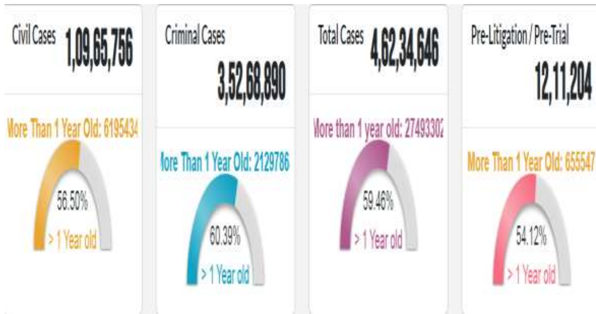
Figure- 3-Age wise pending Cases in India

https://njdg.ecourts.gov.in/njdg_v3//?p=home/index&state_code=&dist_code=&app_token=4f78d97607a72ebd0f9d52abe64957cc4aa991d8712ec659762a12ff04e6cb4f